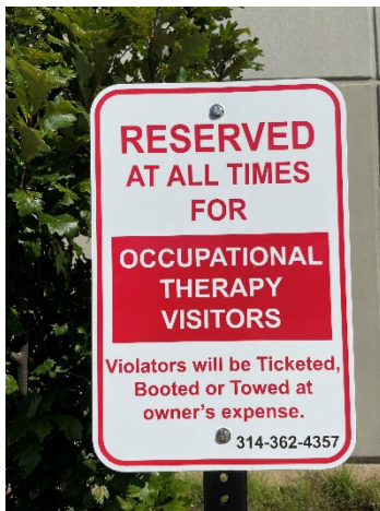
5 reserved parking spots available