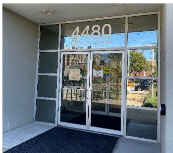
Entrance to 4480 Clayton Building

Please come to the entrance of the building and a study team member will meet you to let you in. Assessments and casting will happen in the Program of Occupational Therapy, in the first door to your right inside the building