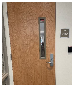
First door on right